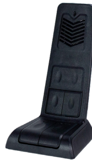
Desktop Microphone DM350HD