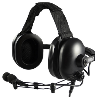
High Noise Behind the Head Headset HS75NR-X03S