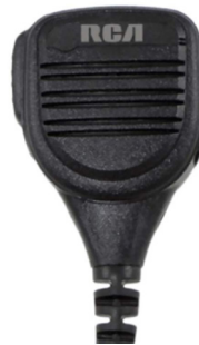
Medium Duty Speaker Mic SM220-X03S