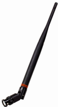
Antenna ANB2750 V/U