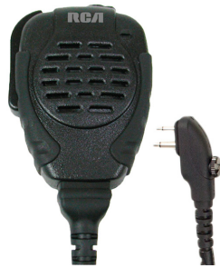
Heavy Duty Speaker Mic SM310-X03S