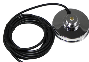
Universal Mobile Antenna Mount G8PI