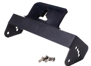
Mounting Bracket MB2750SCK