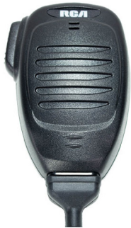
Mobile Microphone MM301HD