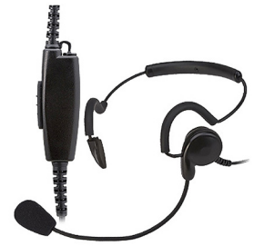
Light Duty Behind the Head Headset HS12-X03S