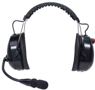
High Noise Over the Head Headset HS65NR-X03S